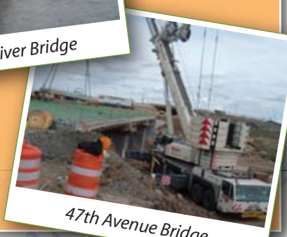
47th Avenue Bridge