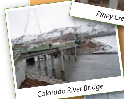
Colorado River Bridge